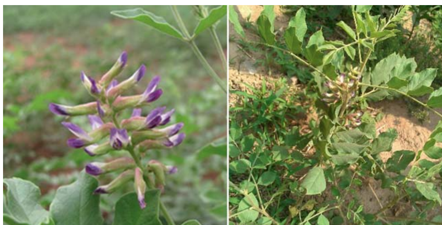
Fig. 1 Glycyrrhiza uralensis Fisch. (Color figure available online only.)

GC exerts its antitumor activity by attenuating the level of TNF- \alpha , declining the depletion of the mucous layer, shifting sialomucin to sulphomucin, and inducing cancer cell apoptosis through the caspase- and mitochondria-dependent pathways [8,18]. GA induces apoptosis and cell cycle arrest in the G2 phase, and down-regulates the expression of NF- \kappa B, vascular endothelial growth factor, and MMP-9. 11-DOGA also induces apoptosis and cell cycle arrest in the G2 phase. However, it presents lower toxicity [10,19]. ISOA induces mitochondrial outer membrane permeabilization and inhibits CDK2 and the mammalian target of rapamycin to suppress cell cycle progression at the G1 phase [11,20,21]. LCA blocks cell cycle progression at the G2/M transition [23], inhibits the expression of uridylyl phosphate adenosine, phosphor-JNK, and phosphor-map kinase kinase 4 [22], reactivates the ROS-dependent pathway, and induces cancer cell apoptosis by an endoplasmic reticulum stressor through a caspase-dependent FasL-mediated death receptor pathway [25,26]. LCB leads to S phase arrest, enhances Bax expression, activates caspase-3, cleaves the poly ADP-ribose polymerase protein, and decreases the expression of cyclin A, CDK1 and CDK2 mRNA, cell division cycle 25 (Cdc25A and Cdc25B) protein, Bcl-2, and survivin [16]. ISL and LCE inhibit upstream signaling pathways [17,27]. GLD inhibits